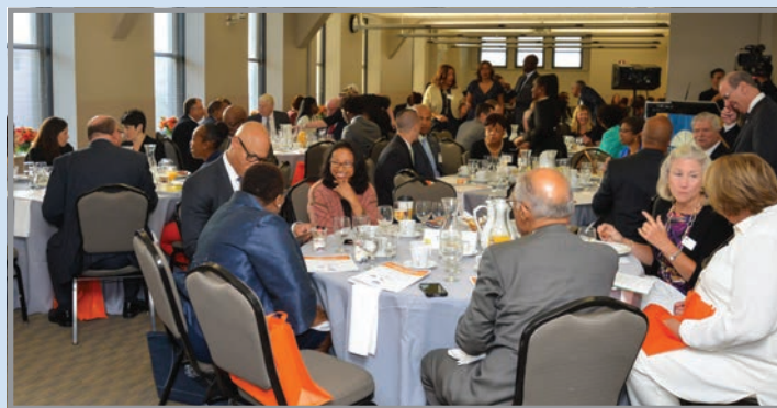
More than 100 cross-sector leaders convened to discuss the role of education in building stronger citizens, communities, and economies.

reimagine education when it became one of the first institutions of higher education in the country to open its doors to women. Today, Peirce recognizes that in order to continue doing this work well, it is important that thought leaders across sectors are invited to Peirce's table to inform, learn from, and support the College's work and mission. The Executive Leadership Breakfast was just that — an invitation to remarkable educators, equity-focused employers, community-impact funders,