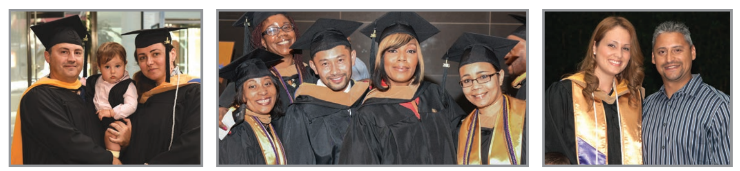
The majority of Peirce students are working adult learners, juggling multiple priorities while they demonstrate the tenacity and hard work needed to complete a rigorous, career-oriented academic program.