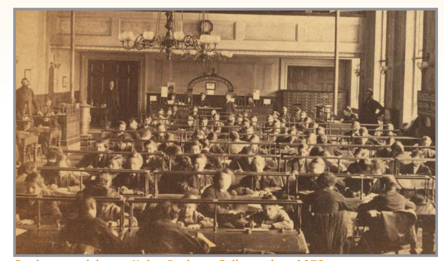
Students studying at Union Business College, circa 1876